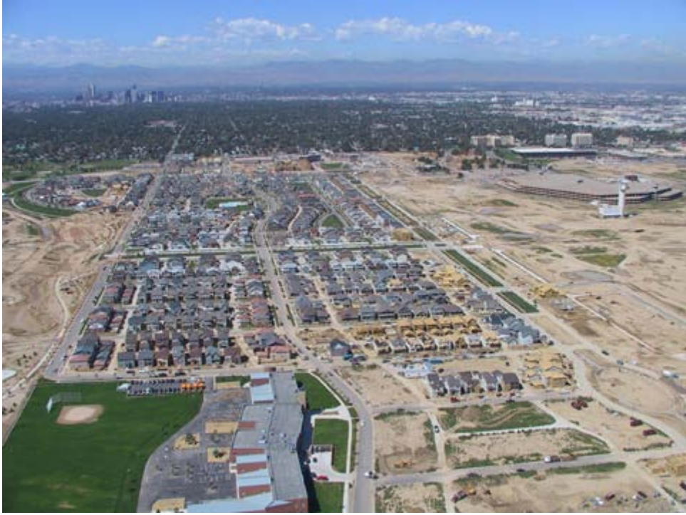
Stapleton's first public elementary school and a public charter school share the building and athletic fields at lower left; at least three more elementary schools and two high schools will be built there. The downtown Denver skyline and mountains can be seen to the west.