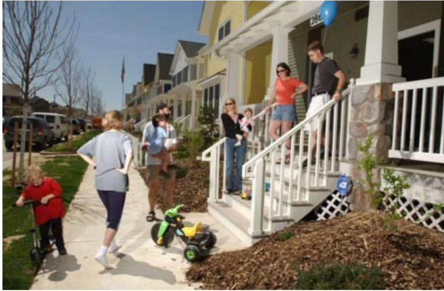
Stapleton's traditional residential neighborhoods feature sidewalks, front porches, and modest lot sizes.