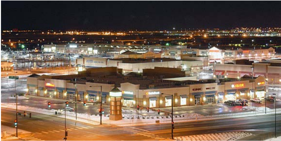
Quebec Square, a regional retail center, is one of Stapleton's primary and earliest revenue generators.