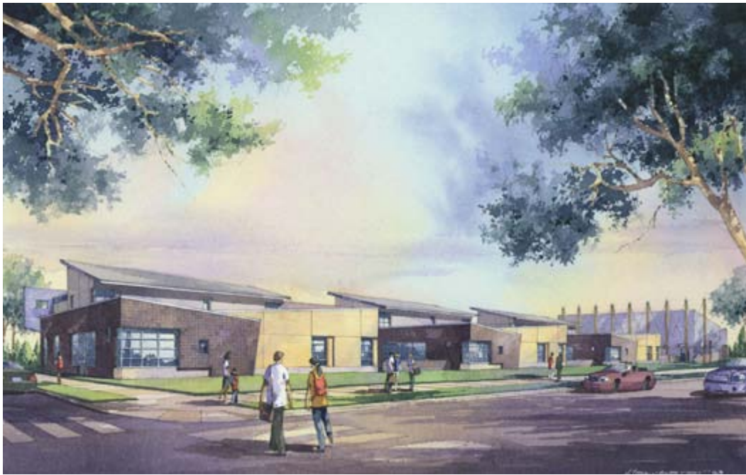
When it opens in fall 2004, the Denver School of Science and Technology, a public charter high school, will be Stapleton's first high school.