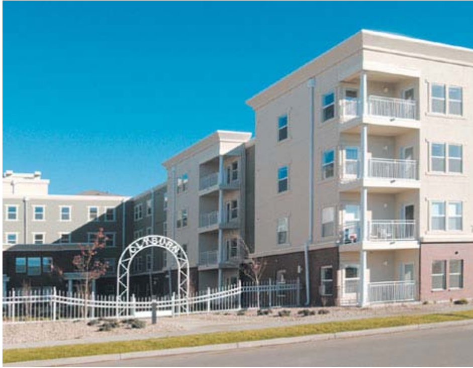
Clyburn at Stapleton contains 100 affordable apartments for seniors.