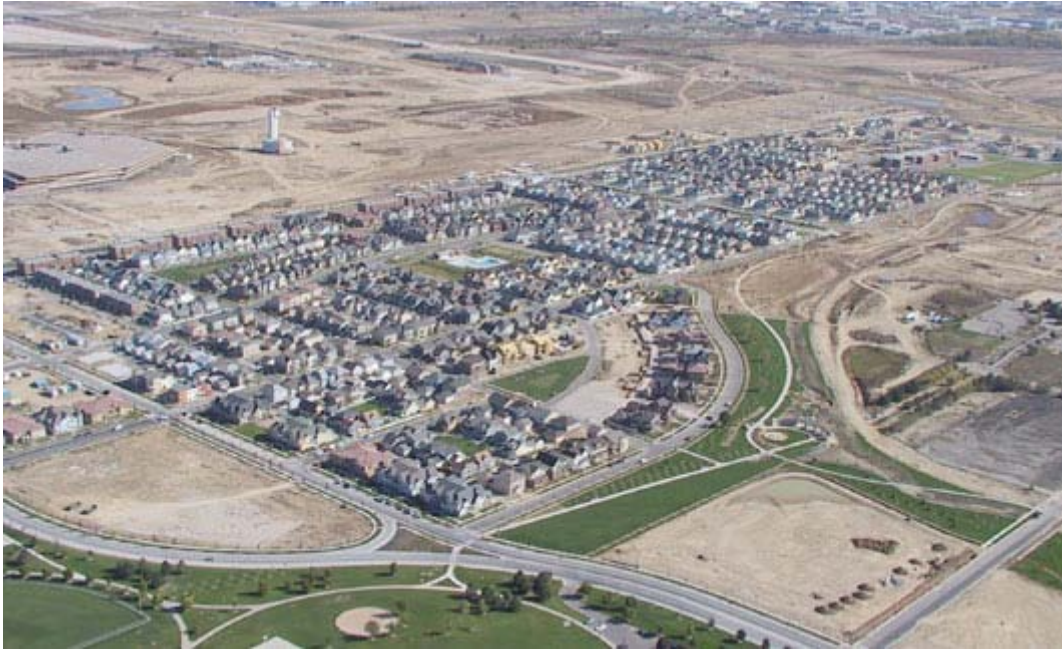
Stapleton's first neighborhood, located on the site of the former airport's east/west runway, is bordered by the beginnings of what will be 1,100 acres of new parks and open space.