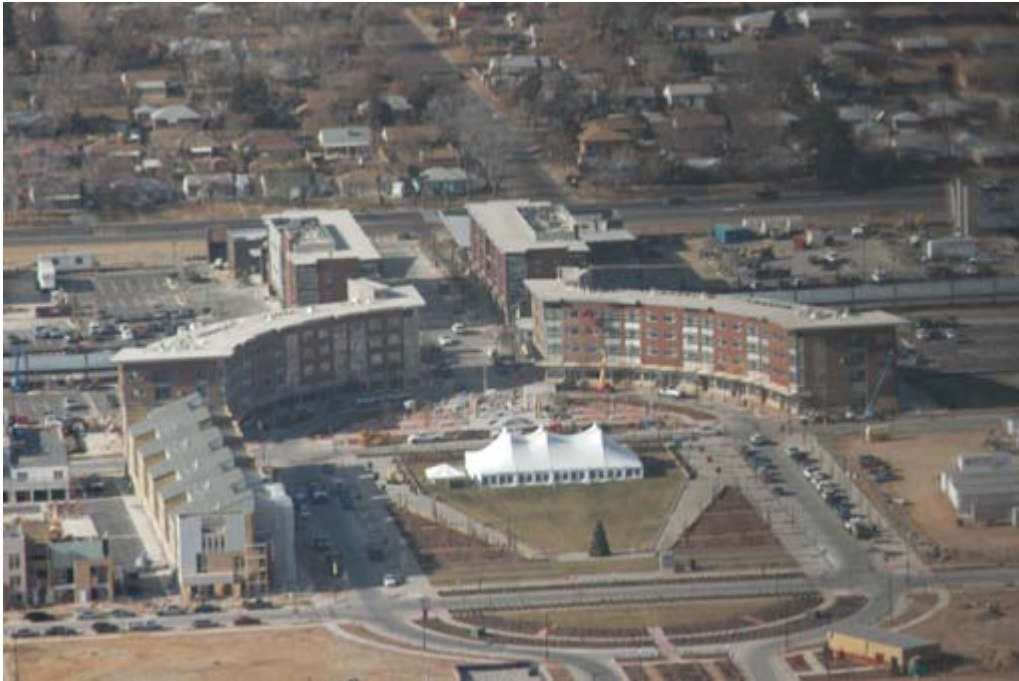
The East 29th Street Town Center features a variety of neighborhood restaurants and stores, a King Soopers supermarket, and offices and residential units above ground-floor retail space.