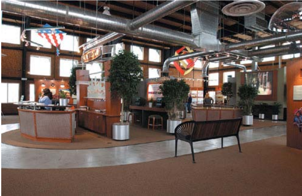
The Forest City Stapleton Visitor Center presents information about the community to prospective homebuyers, renters, business owners, and other visitors.