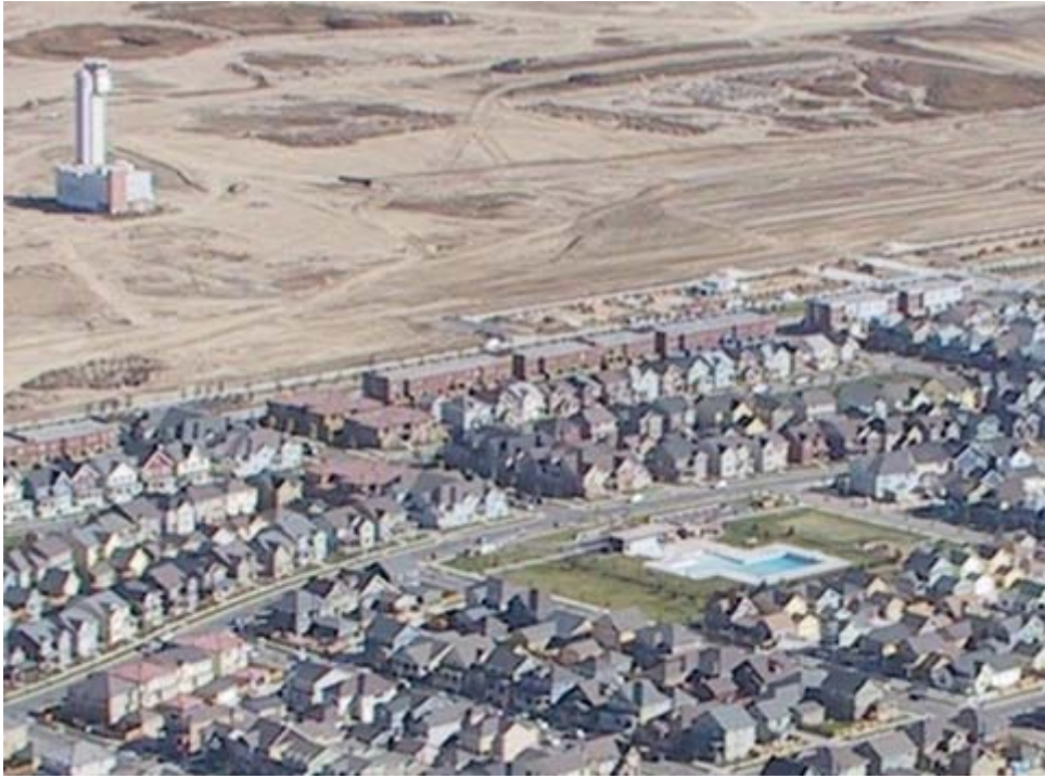
Stapleton, the largest infill development project in the United States, is a mixed-use, master-planned community under construction on the site of the former Stapleton International Airport in Denver, Colorado.