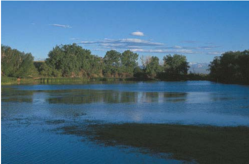
The Bluff Lake Natural Area is home to a wide variety of wildlife.