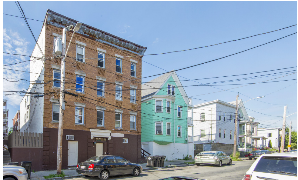
40 Ward Street, before rehabilitation by Davis Square Architects and the North Shore Community Development Coalition. (NSCDC)