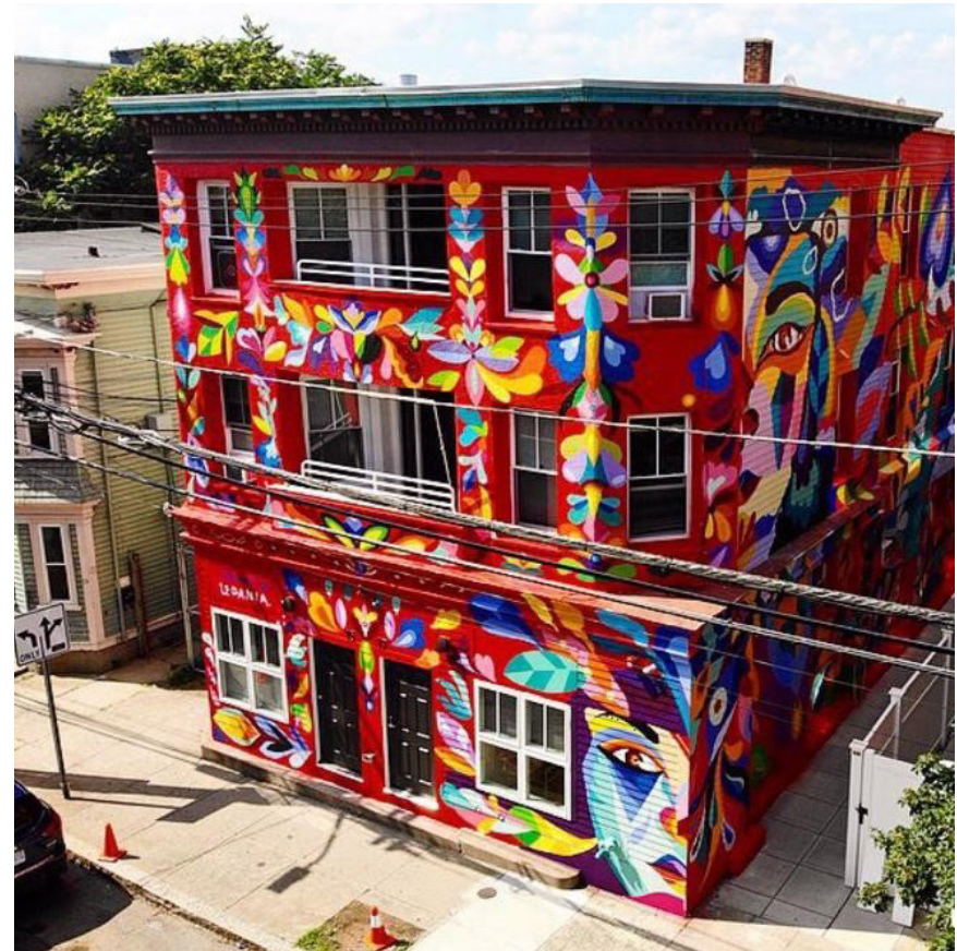
Harbor Crossing, located at 15–17 Harbor Street, was remodeled in 2018 to provide youth housing. It is part of Harbor and Lafayette Homes, renovated by ICON Architecture and North Shore Community Development Coalition. (NSCDC)

According to Darrell Aldrich, architect with Davis Square Architects, Northcutt was adamant about making the buildings and public spaces exceptional. Historic facades were restored and upgraded. Some of the buildings were restored to allow for ground-floor retail. Alleyways and street fronts were landscaped and cleaned. All public-facing doors were replaced with those of mahogany in the historic style of the building era. Aldrich stated that the most rewarding aspect of working with the NSCDC in the Point neighborhood was "taking the dilapidated buildings and making them gorgeous."