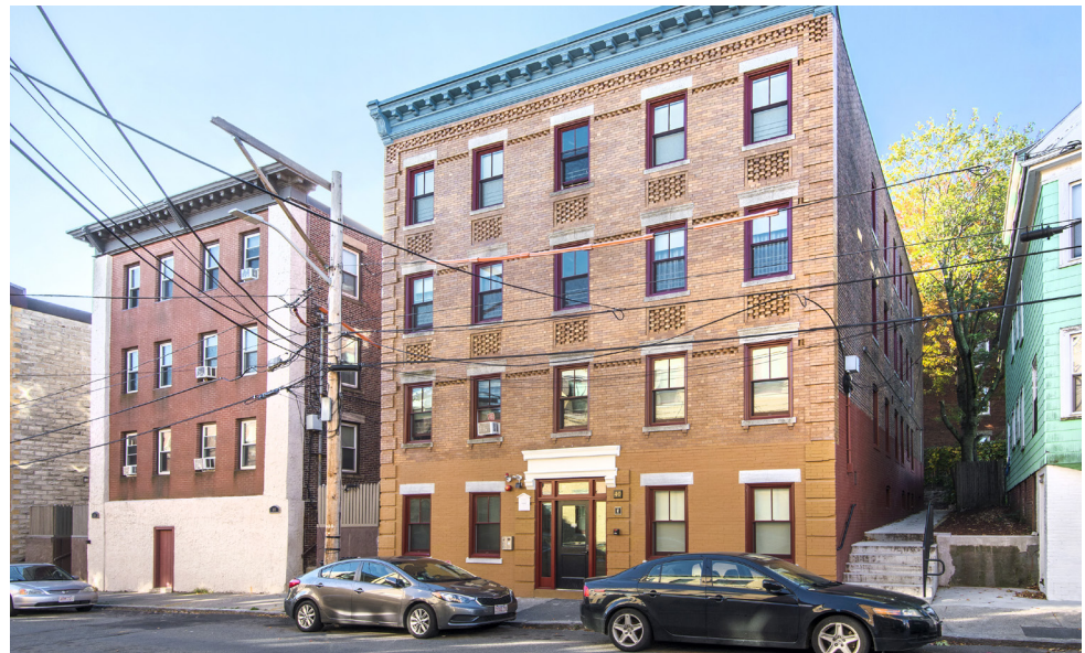
40 Ward Street, after rehabilitation. (NSCDC)