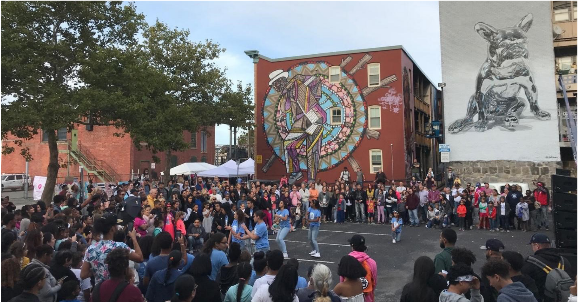
Murals such as Le Quedo Bufeaito by Don Rimx and Chrome Dog by Bikismo overlook the Fiesta de la Calle block party near 38 Peabody Street. (NSCDC)

Before PUAM came into existence, the Point was geographically, socially, culturally, and economically isolated from the rest of Salem. The museum was key to increasing pride of place and reducing outsiders' negative view of the Point neighborhood—representing a deliberate move to use art to counter racism and prejudice. Now, some of the murals are visible from downtown Salem and the neighborhood has indoor and outdoor public space for special events, many of which have wide appeal to the greater area. The annual Fiesta en la Calle, with Dominican music, food, and performances highlighting the heritage of the resident