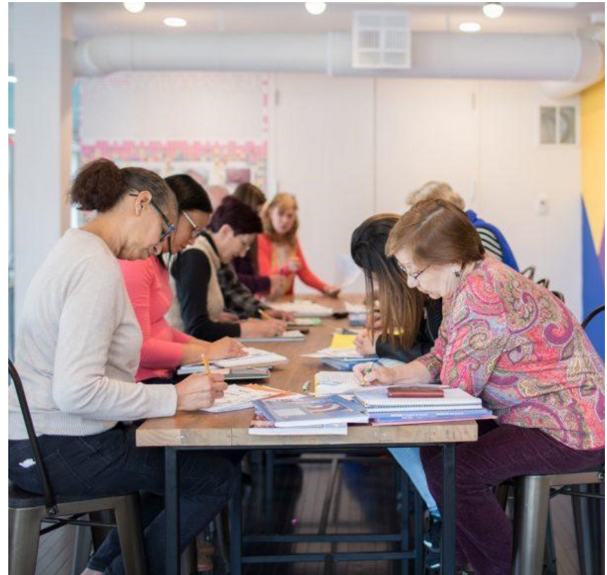
Espacio is the 2,000-square-foot community center on the ground floor of 105 Congress Street.

PUAM includes indoor and outdoor public space for special events and resident use. The outdoor space includes what was previously a parking lot and is now used for seasonal exhibitions and festivals.