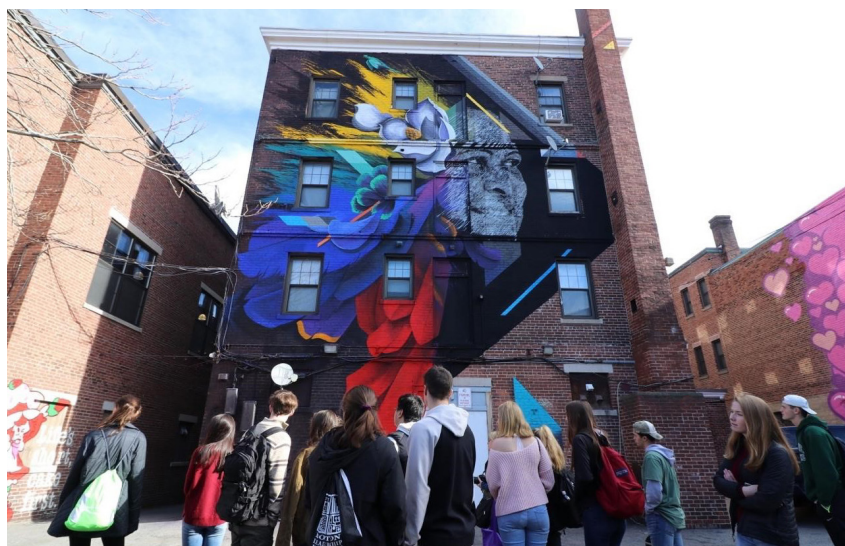
Students tour the Point Neighborhood. NSCDC uses the tours to educate students about systemic racism.

The NSCDC used art and design in service of community revitalization, promoting pride among residents while inviting visitors to take part in the community. Anecdotally, the arts focus supports local education and training programs, which in turn spurs social mobility. The Point's murals and community festivals showcase the strong cultural heritage of the various community residents. The fact that Salem already had a strong tourist economy allowed PUAM to leverage investments from city, state, and philanthropic donors.