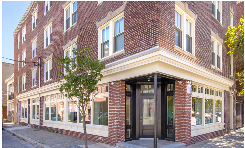
105 Congress Street Apartments, after the 2016 remodel by North Shore Community Development Coalition. (NSCDC)