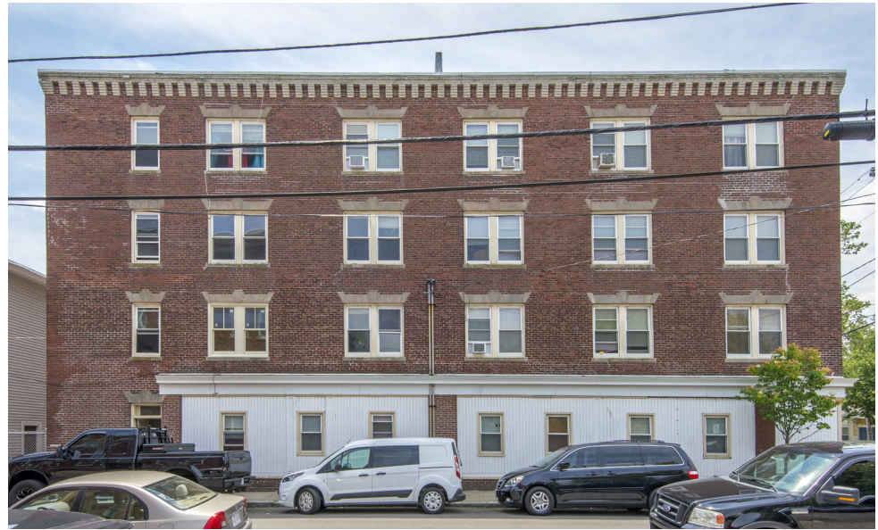
105 Congress Street Apartments, before the remodel. (NSCDC)