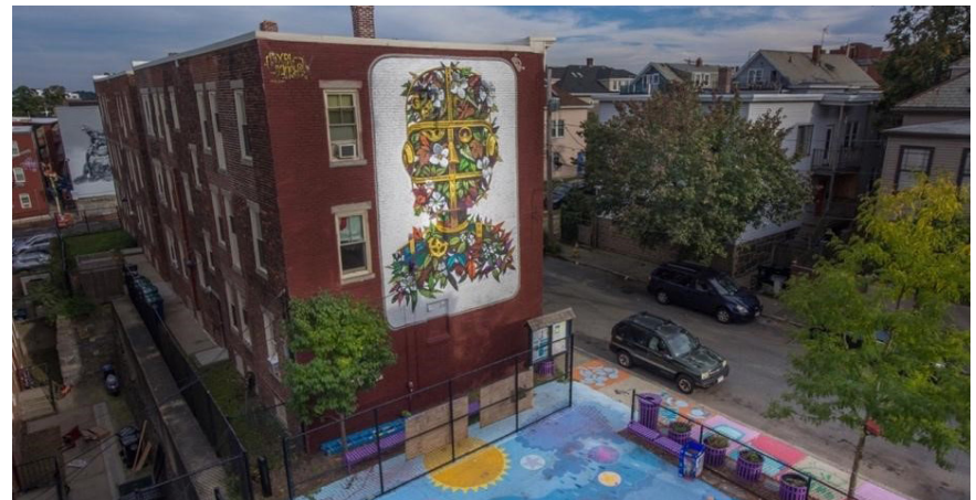
Ward Street Pocket Park today: Garden Boy , a PUAM mural by artist Pixel Pancho, overlooks a basketball court. (NSCDC)