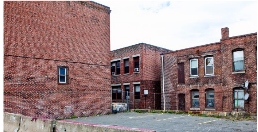
Before its transformation to become Ward Street Pocket Park, 15 Ward Street had long been a dumping ground for solid waste, structurally unsound, and a hazard to neighborhood kids who used it as an informal play space. (NSCDC)

This street painting was one of the early activities that led to the evolution of the Punto Urban Art Museum. For many years, 15 Ward Street was a dumping ground and a hazard to neighborhood kids who played there. The NSCDC, collaborating with Mayor Kim Driscoll, convinced the absentee owners to sell it to the NSCDC for the cost of their 10 years of back taxes. The NSCDC then raised funds for the redesign and full renovation to become the Ward Street Pocket Park.