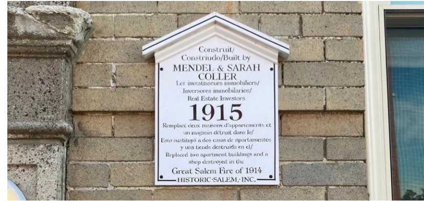
Plaque in French, Spanish, and English designating a building in the Point neighborhood as a significant historical structure. (NSCDC)

The Point’s listing on the National Register of Historic Places, the restoration of many of its early-20th-century masonry buildings with affordable housing, and awards for preservation efforts have been an important source of pride for the community. A small but meaningful addition through a New England preservation organization has been the mounting of historic marker plaques in French, Spanish, and English on the first 20 buildings. The multilingual plaques represent the Point’s long history as home to French Canadian immigrants as well as more recent Latino residents, sending a message that this is a special place.